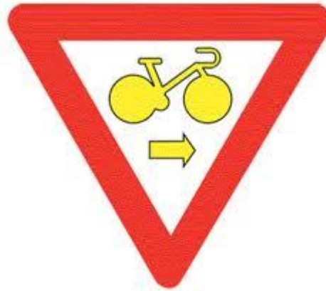
FIGURE 1 Traffic sign indicating that RTOR for bicyclists is allowed (Belgium).

The RTOR for bicyclists can have two important safety effects, i.e. local effects and supralocal effects. To the best of the authors' knowledge, none of these two possible effects have been formally examined in scientific literature so far.